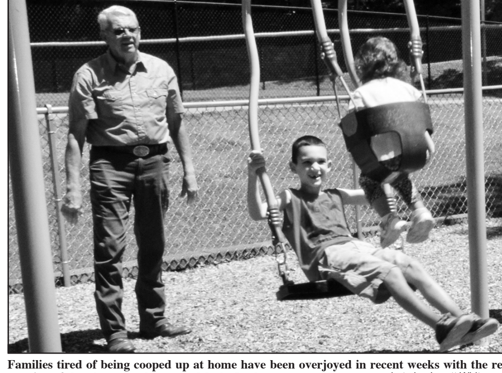
Families tired of being cooped up at home have been overjoyed in recent weeks with the reopening of the playground areas at Meeks Park.